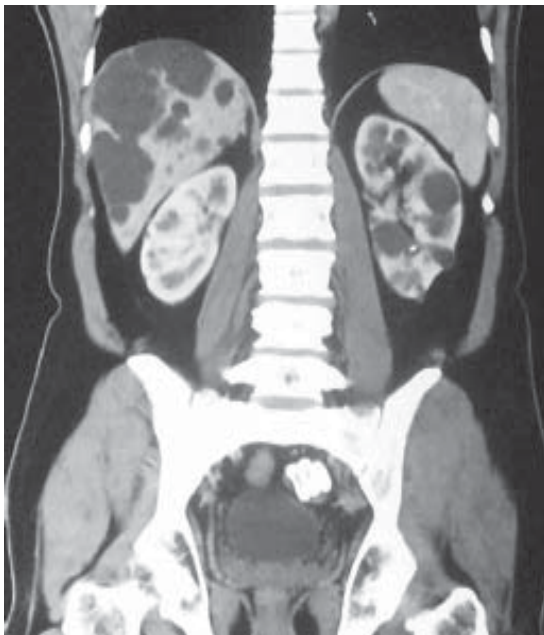
Fig. 2 : CT Scan showing calculi near bladder

operative recovery was uneventful. Histopathology of specimen revealed non-specific stricture with no evidence of tuberculosis or malignancy. Follow up of 1 year has shown patient to be symptom and disease free.