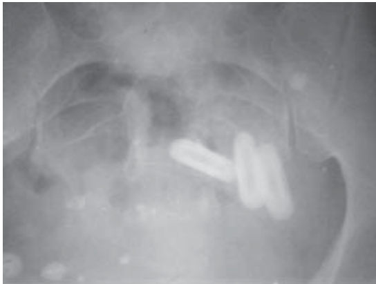
Fig. 1 : X-ray showing Radio opaque densities in Pelvis